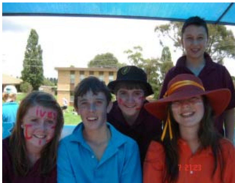
Swimming motto: Shade-Shirts-Hats-Sunscreen