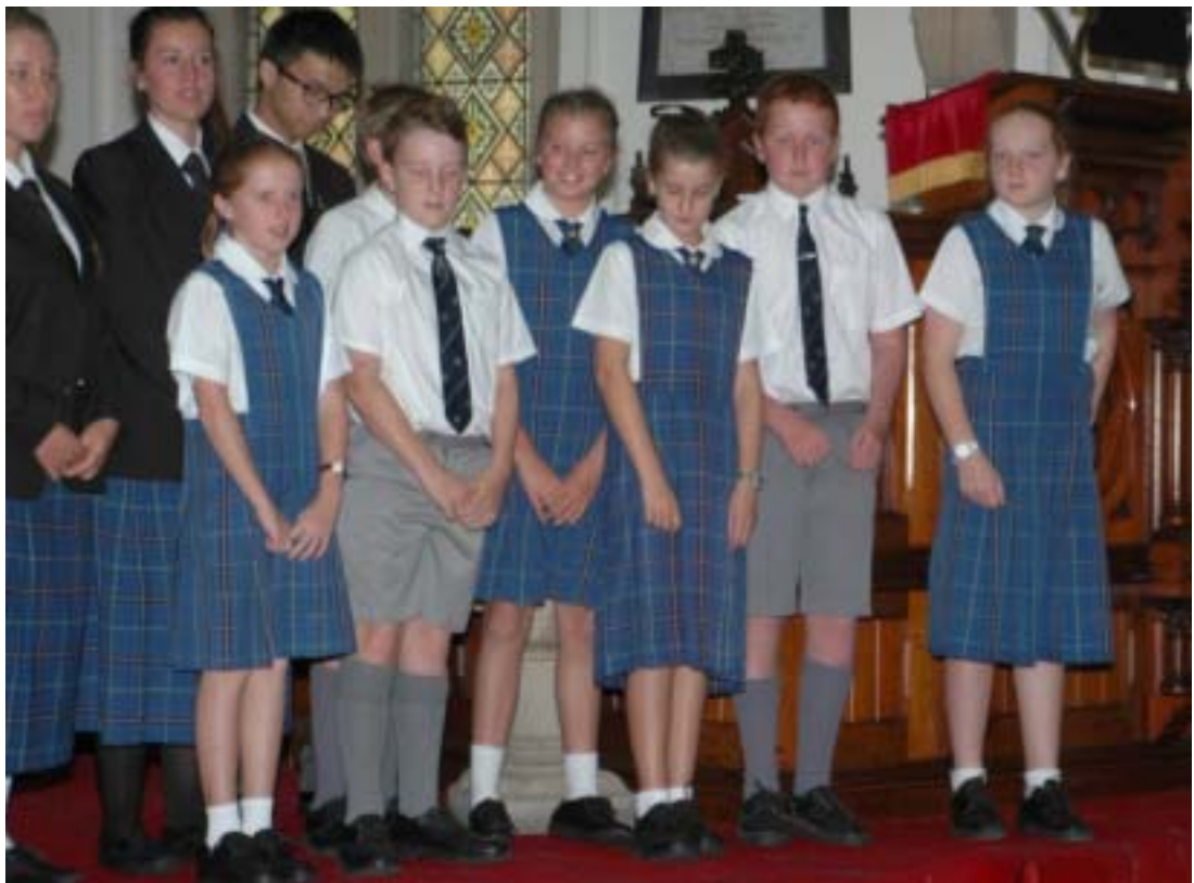
Below: Junior School Leaders