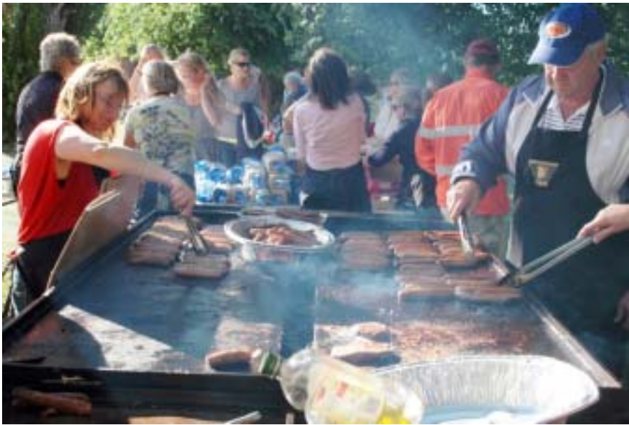
P&F Barbecue was very popular.