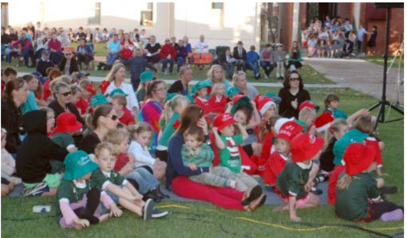
Junior School waits to perform