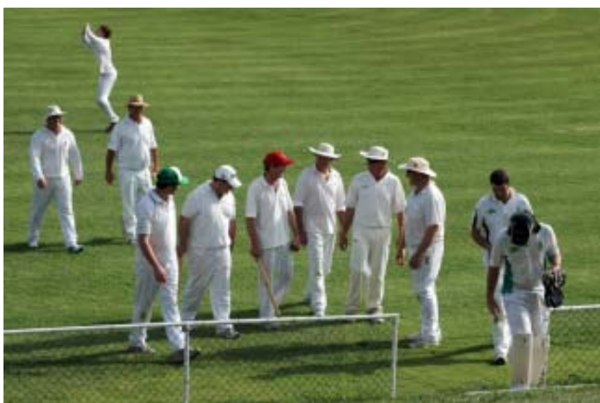
The victorious old boys leave the field