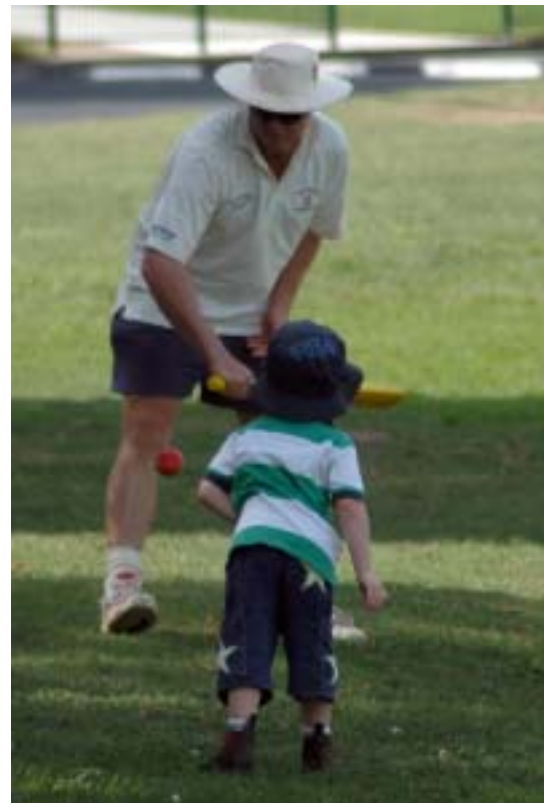
A third generation of Radfords bowling with style