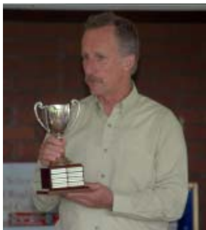
The Jamie Saba Trophy