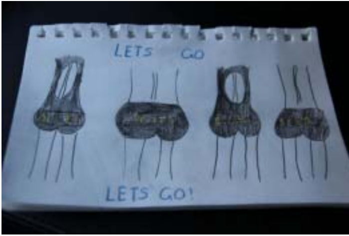
Clever drawing Sophie! Well done!