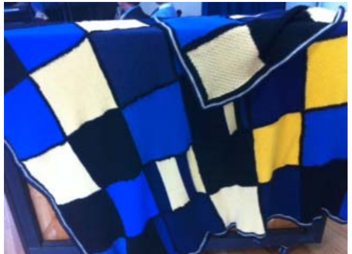
This is one of the great prizes in the Guessing Competition.