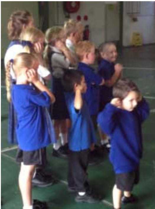
The siren was sooooo loud!