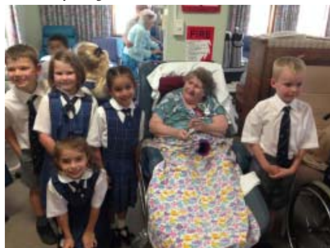
The residents were happy to see our students again