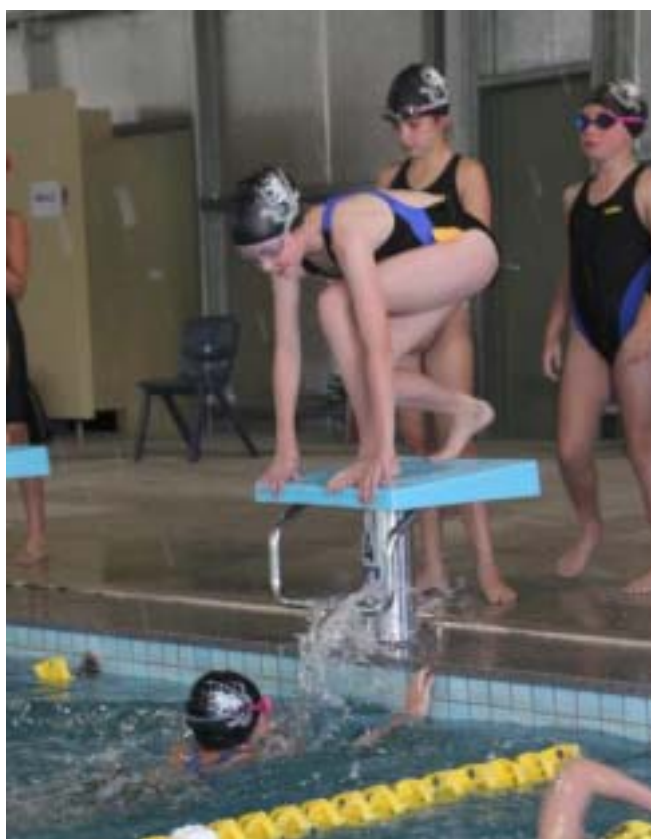
The Junior girls relay at changeover