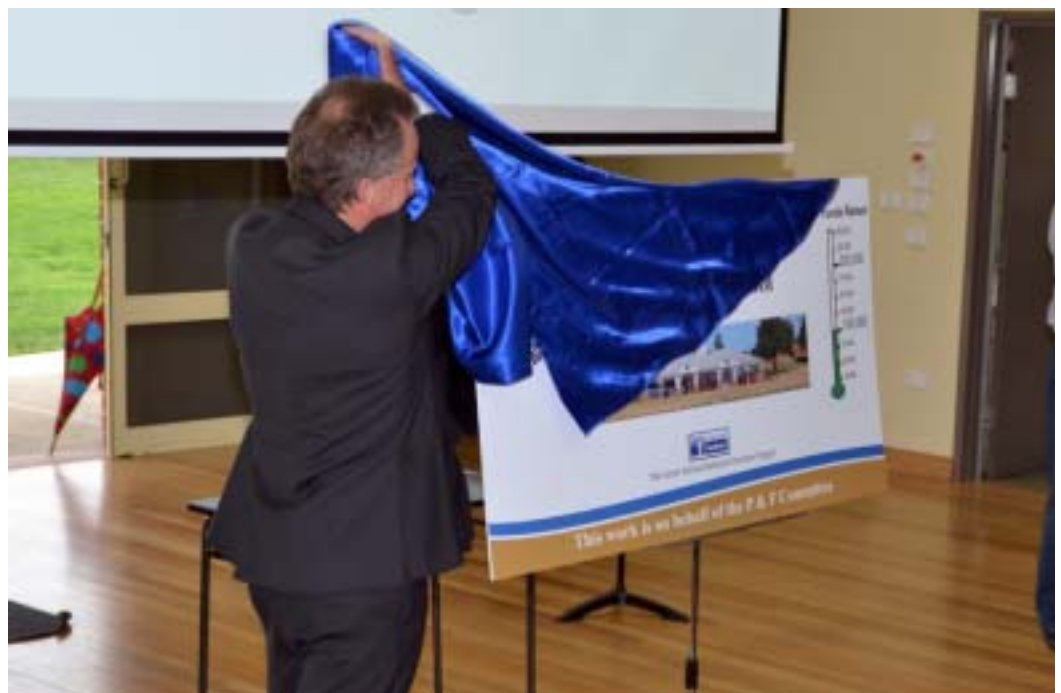
Mr Gates unveiled the sign which will gauge the donations received