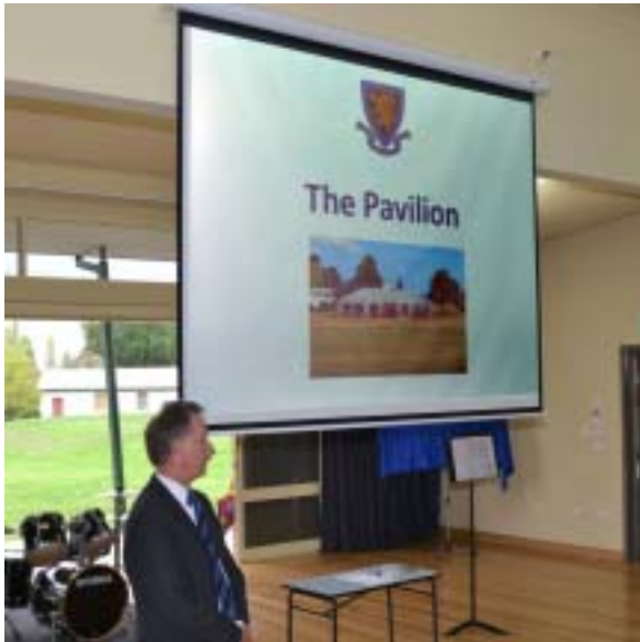
Mr Gates presented the slide show of the proposed building