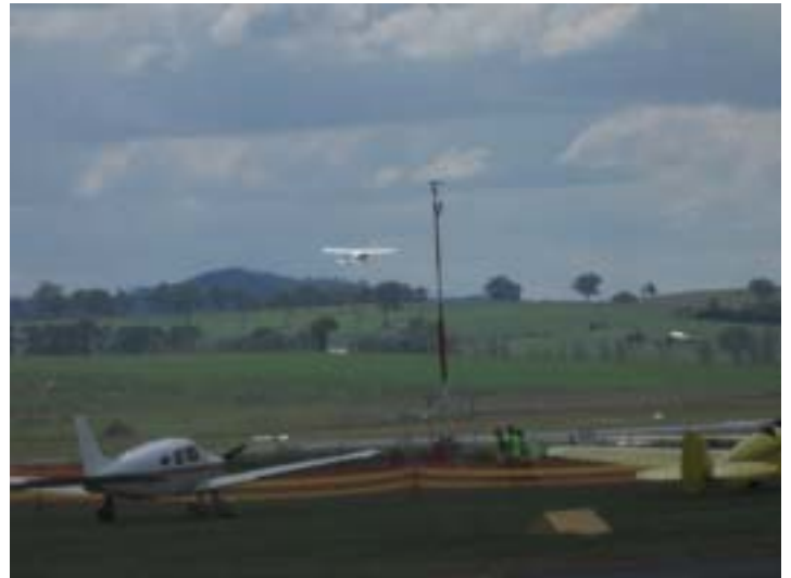
We had a great view of Mount Panorama