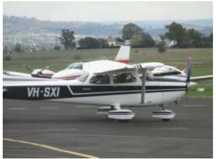
Sophia Iwasaki flew the plane at take off!