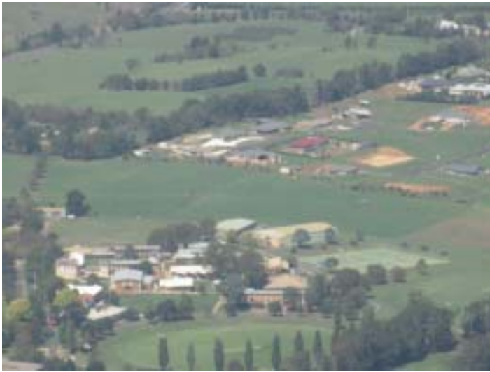
The school grounds looked lush and green from the air