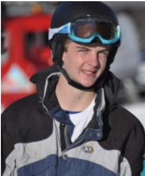
Ready to Ski