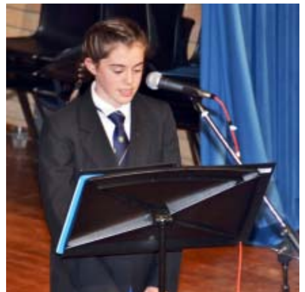
Mia Wallace did a big solo vocal number