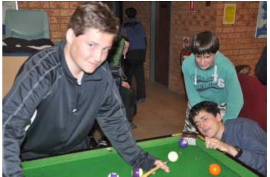
Time to socialise at the camp