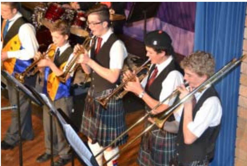
The Brass Section