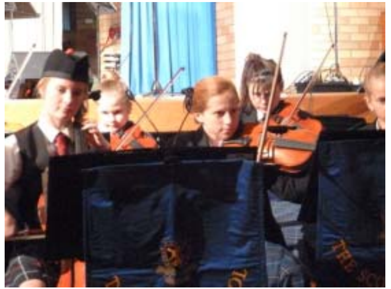
String Ensemble at Highland Jazz Night