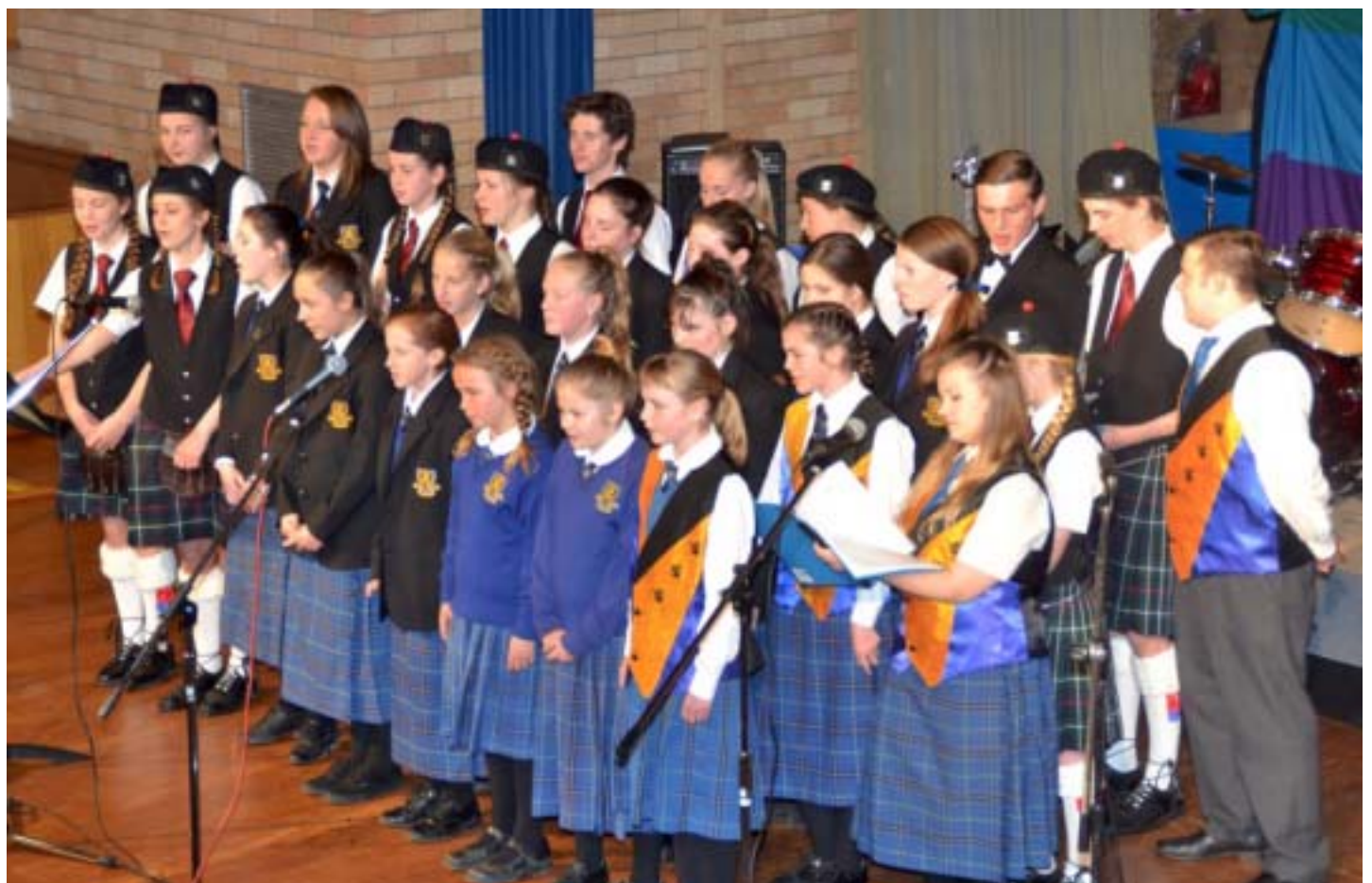
The Choir -- wonderful voices combined of both Junior School and Senior School students

Thank you students and staff for your participation and hard work to present another amazing Highland Jazz Night!