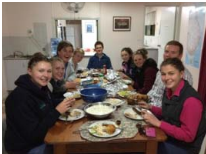
Year 11 Agriculture "Out West" Excursion -- dinner together and a visit to the abbottoir