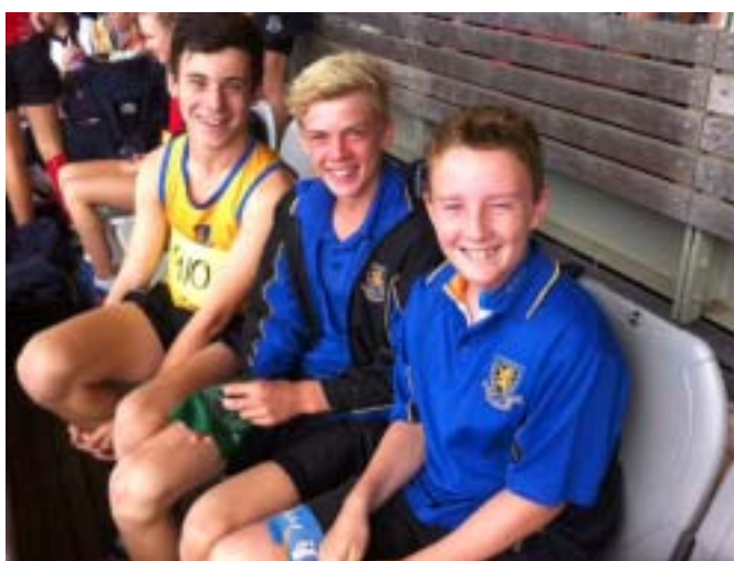
Junior Boys relay team