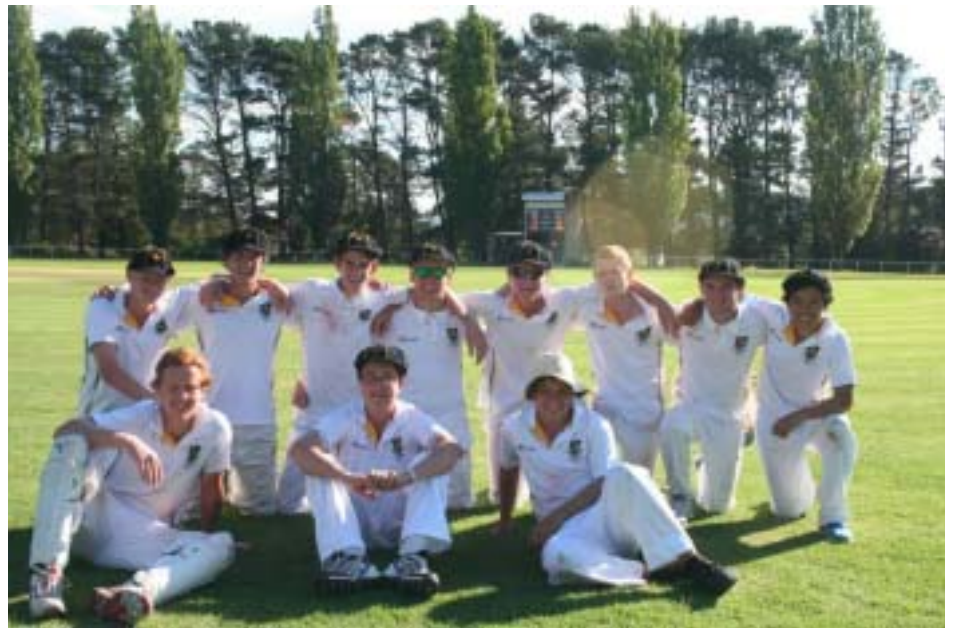
The First XI