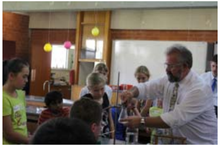
Archaeology dig and a visit to the Science Labs