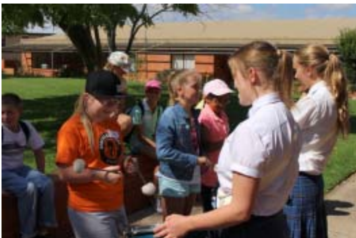
A quick lesson from our expert drummers