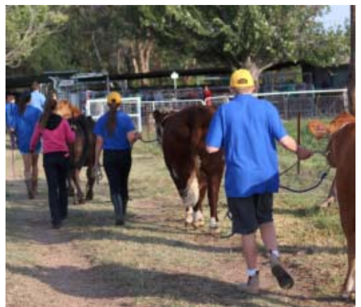
Cattle team members showed off their steers