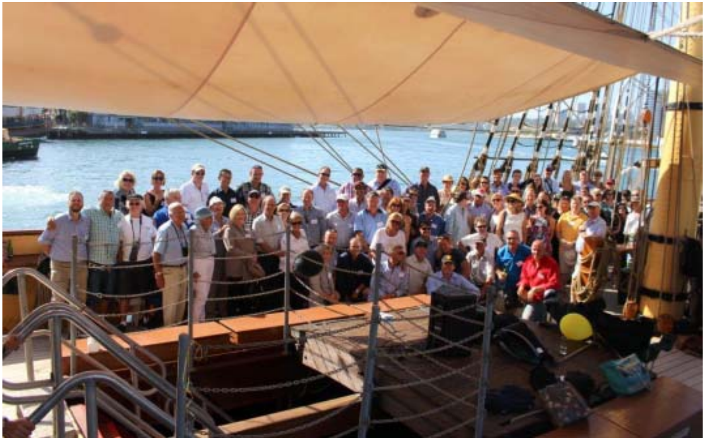
All aboard for a beautiful day on Sydney Harbour