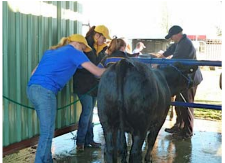
Washing the steers at the show