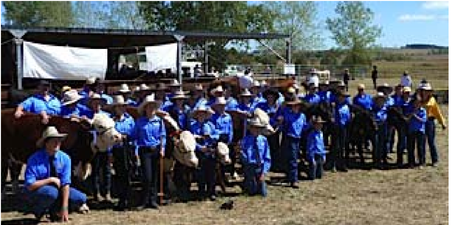
The whole team