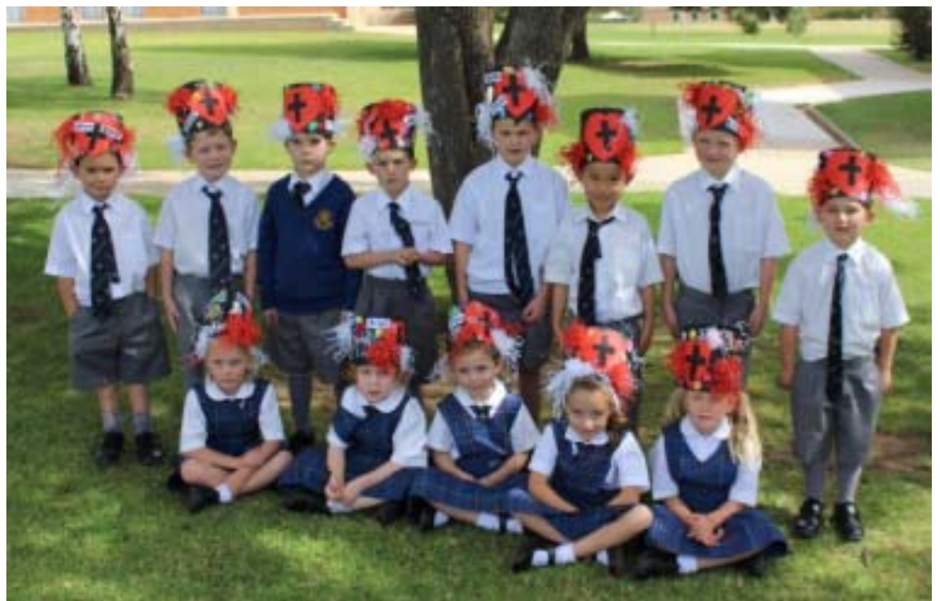
Our Kindergarten class posed for a photograph just before the Easter Hat Parade at the end of Term 1