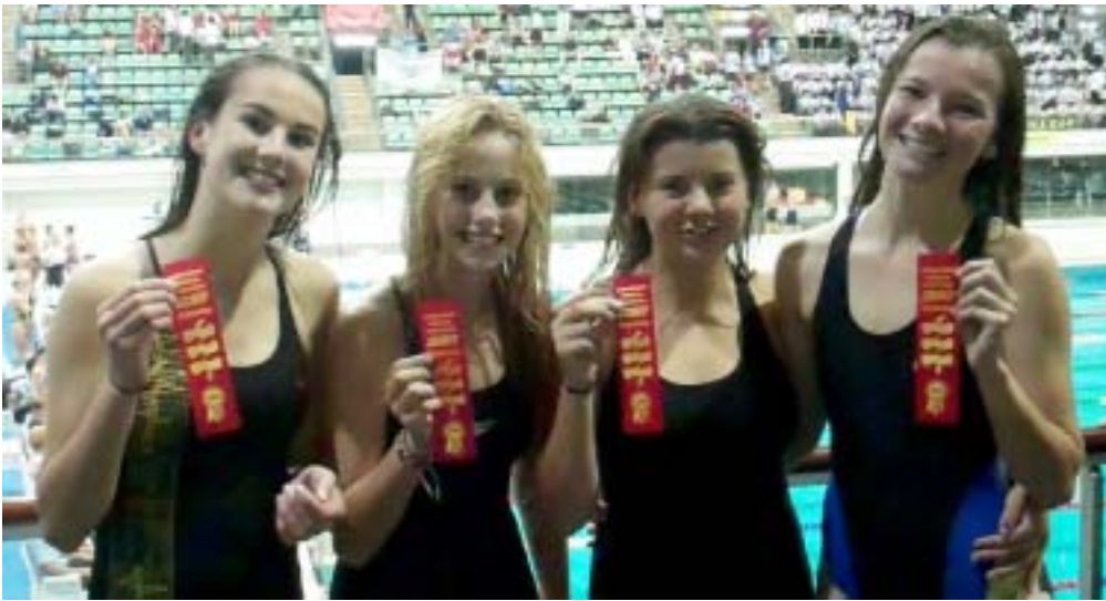
Intermediate girls relay team;