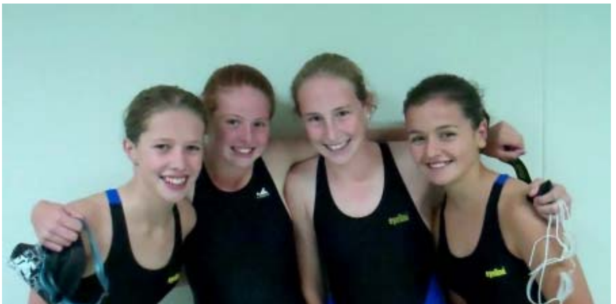
Junior girls relay team