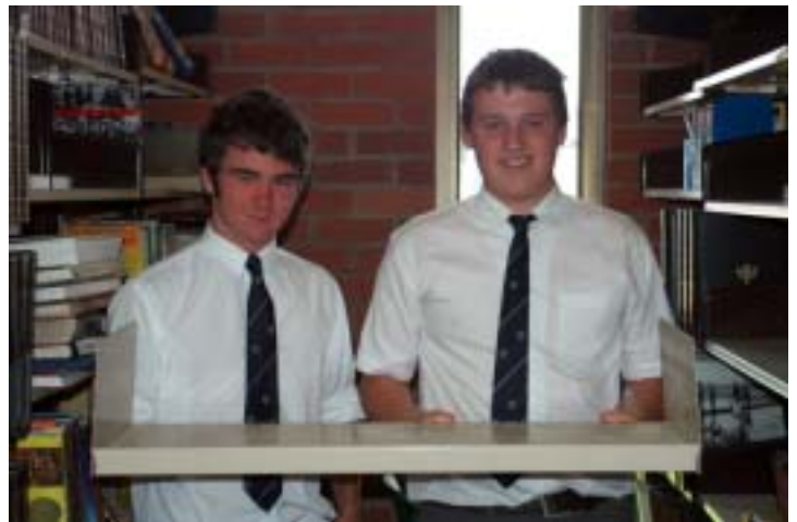
Photo of the tour perhaps...

“you pick the right spear, and we eat your little brother for lunch, eh”