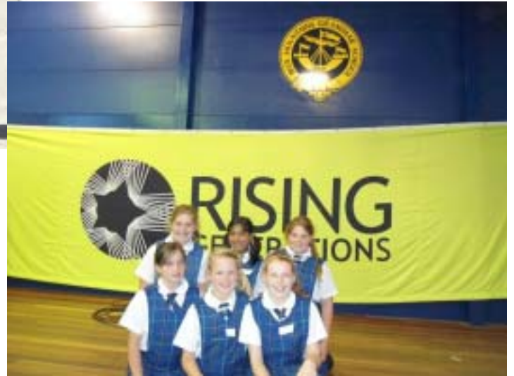
Reading Mentors to our Kindergarten students . . .