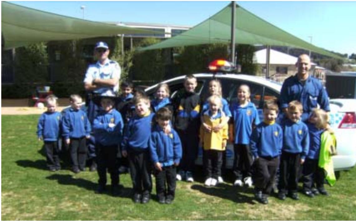
Thank you to the officers from the Lithgow Police Station who visited The Scots School Lithgow.