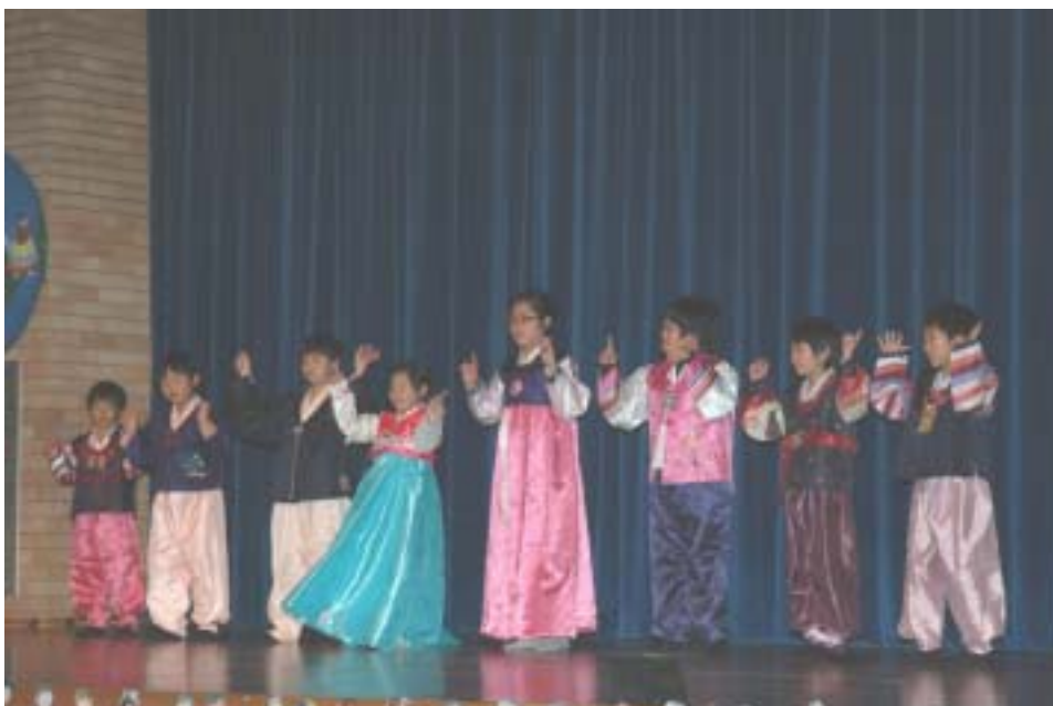
Keystone students from Korea performed in our Prep School Concert on Friday evening.