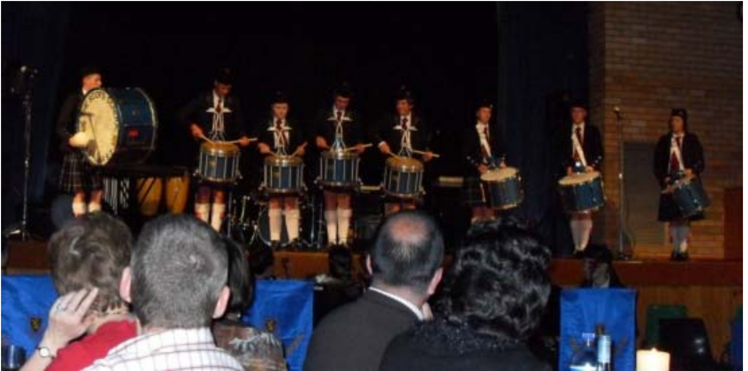
Great Drummers and Pipers!