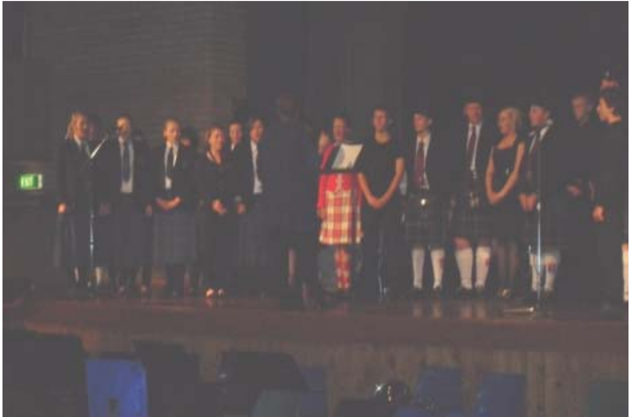
Fantastic performances from a talented group of students.