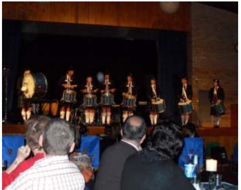
The drummers astounded the crowd with their skills